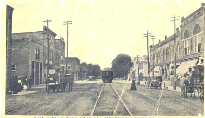
MAIN STREET WEST FROM HOWARD STREET, Greentown, inc